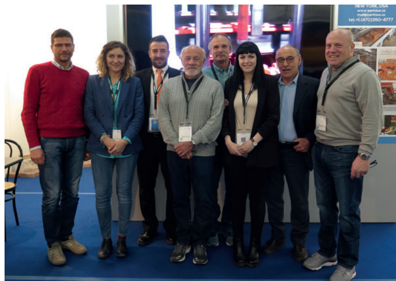
Strong and reliable partners: EP Henry and Penta

Besides handling the blocks Penta took care of the emptied urethane moulds too by cleaning them for reuse. A custom-designed movable scraper advances onto the surface of the mould to remove any concrete residue; then the mould is turned upside down to let the concrete debris fall down to be collected in a waste bin.