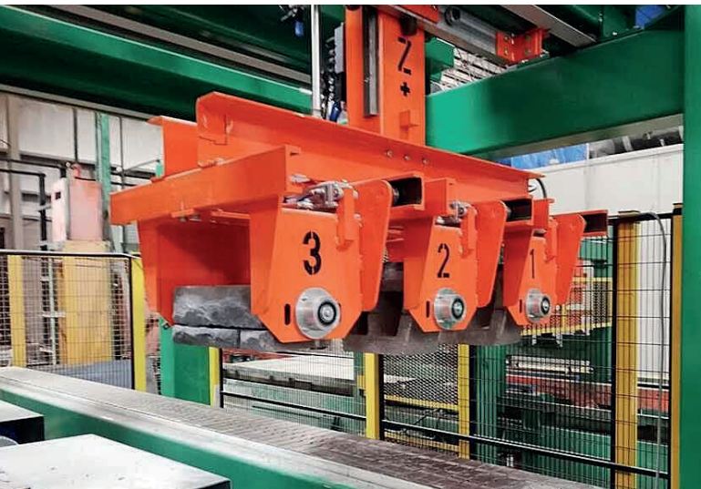
"Cerberus" the programming gripper with three independent heads.

A custom designed gripper picks up the blocks from the movable trolley and turns them by 180° to feed three calibrating lines.