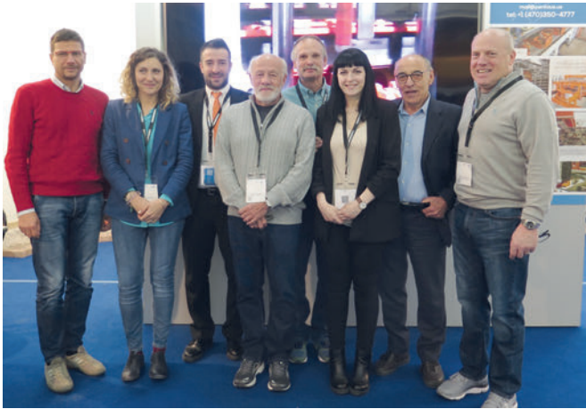
Penta US & EP Henry

parts internally following Penta standards, while other parts are produced in Italy and this company will serve as a storage. In this way Penta can serve customers from East to West in a very short time.