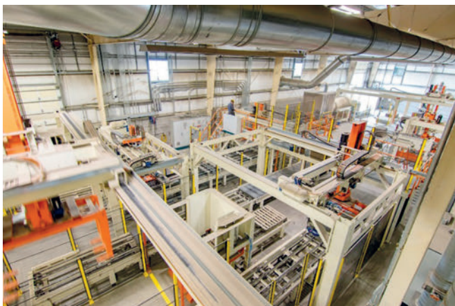
Penta at Western Interlock

Rarely no other plant has reached that productivity and efficiency before. These two automatic plants are respectively a “Caleidos” tumbling and repackaging plant with Quality Control and a multi-function plant with splitting and tumbling treatments integrated in the production plant, allowed